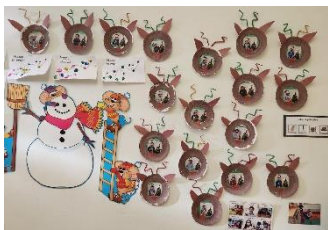
We made reindeer in December and did some finger art!

The preschool is an exciting place to be. Songs, art, games, books, discovery play, and much more keep the preschoolers loving learning. December was a busy month!